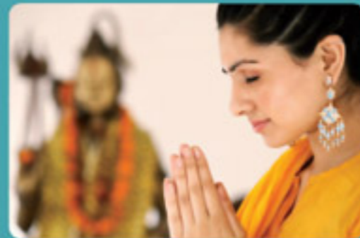
peaceful Meditation hall

For the elderly and the senior citizens of the family, the Executive Park has many exiting options to offer. The most interesting past time being 'Racchhabanda', meaning "the meeting place of the wise people". Besides, there is a spacious Meditation Hall and an exclusive senior citizens Park and a library for knowledge.