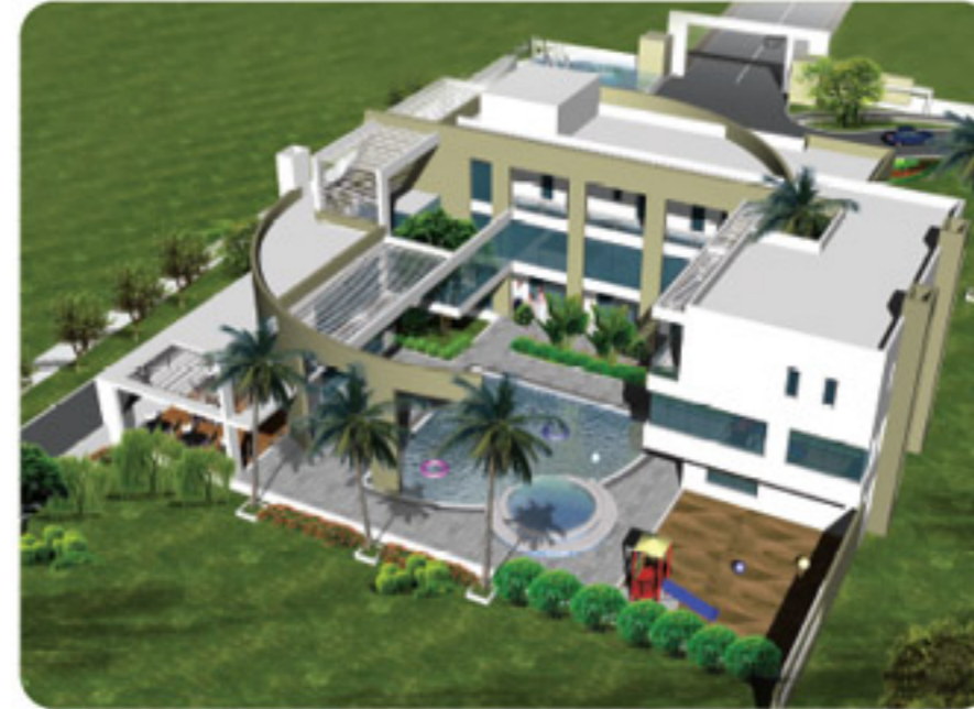
Club house (21,000 sqft)

Children Ladies Elderly people Teenagers Men Guests